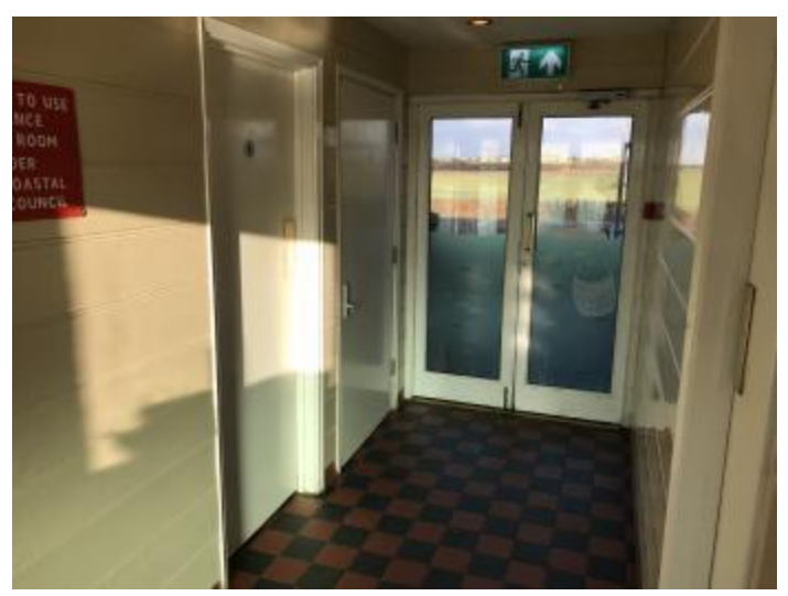
Rear Entrance Level Access Interior