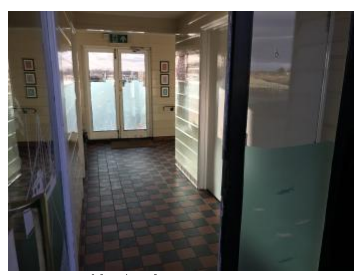
Access to Lobby / Toilet Area