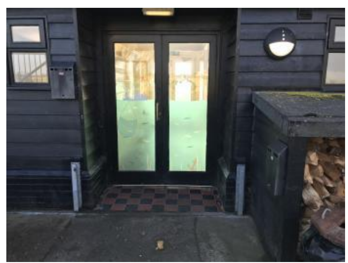
Rear Entrance Level Access