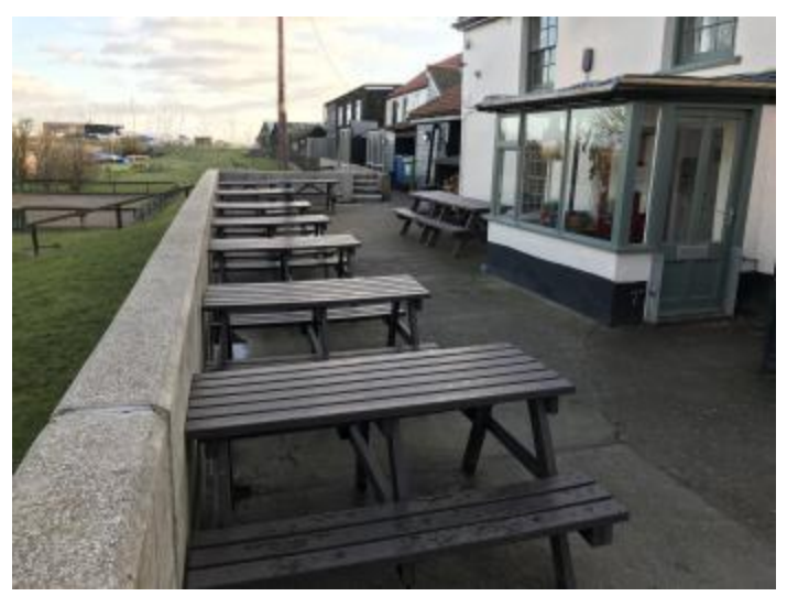
Route To Rear Entrances 2