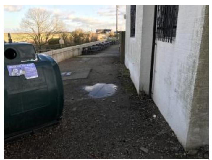
Route To Rear Entrances 1