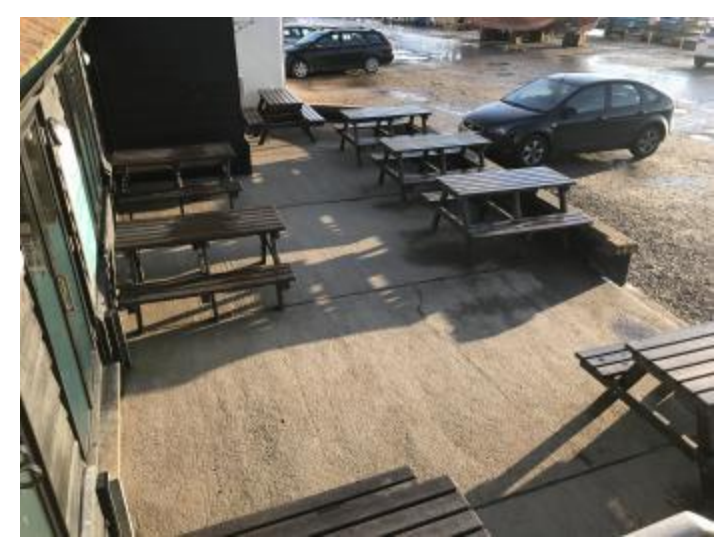
Outdoor Seating Front