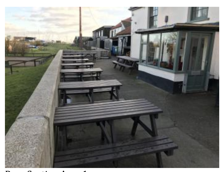
Rear Seating Area 1