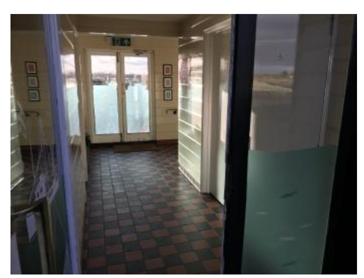
Main Entrance Interior