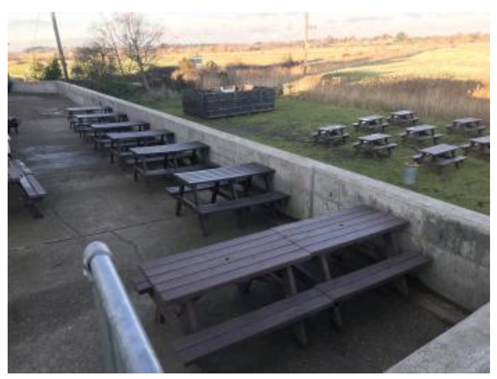
Rear Seating Area 2