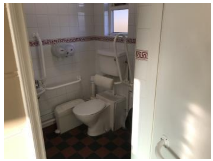
Disabled Toilet 1