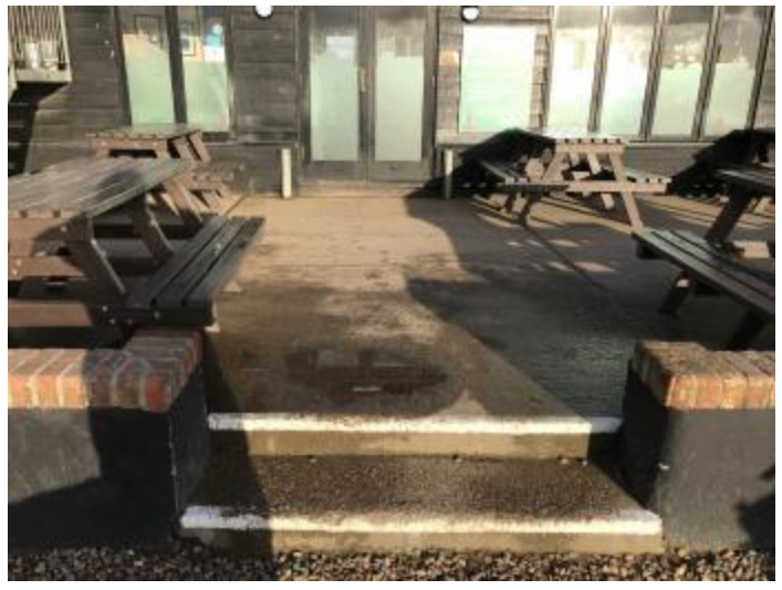
Steps To Main Entrance