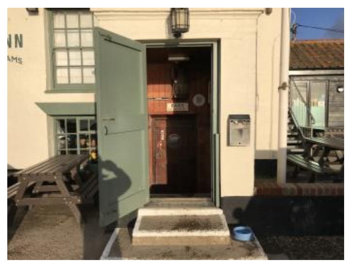
Alternative Front Entrance 1