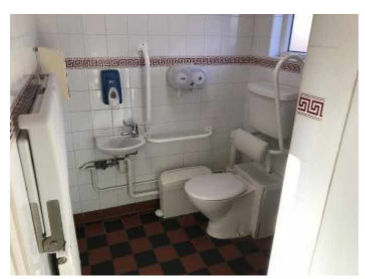
Disabled Toilet 2