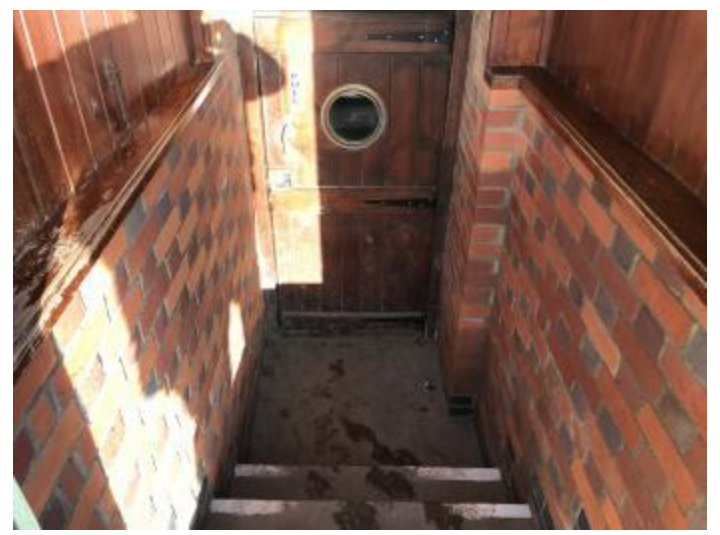
Alternative Front Entrance 2