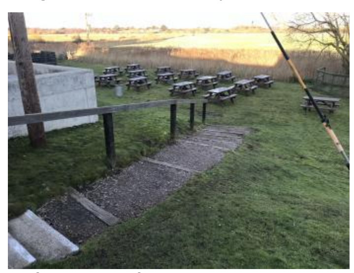
Garden Seating With Steps