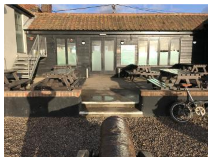
Main Entrance Exterior