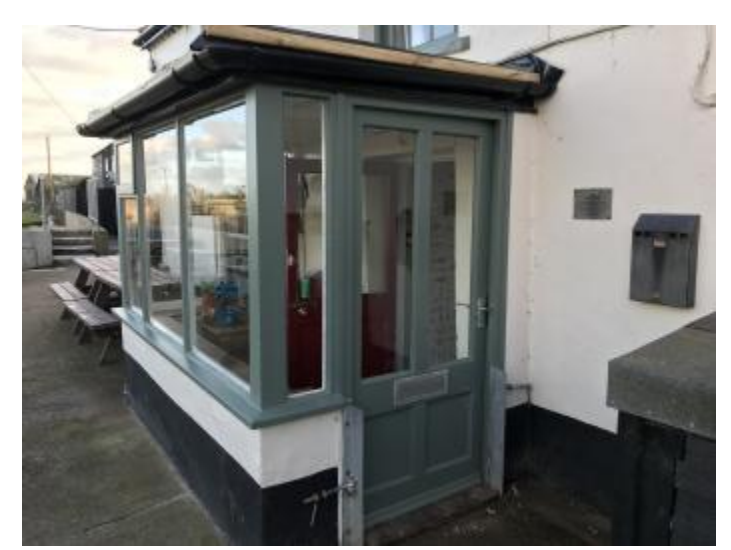
Rear Entrance With Step